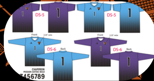
Goal Keeper Jerseys

https://frontlinesoccer.3dcartstores.com/NOSO-Travel_c_158.html